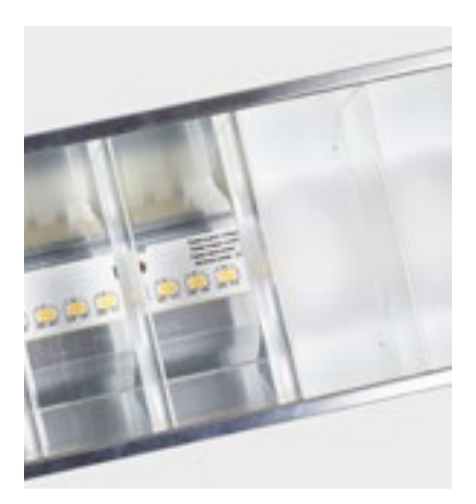
By distributing the luminance from the LED modules, we have created a luminous surface that is comfortable to the eye and eliminates glare.