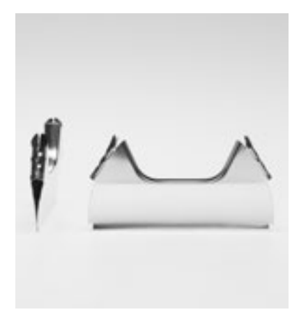
Beta Opti is a new generation of louvre based on our existing T5 R5 louvre technology. The cross blades work in tandem with efficient side reflectors. The patent pending solution is supplemented with a unique film which provides extra precision in the light control.